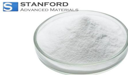
Fig. 1. Nano Silica Powder